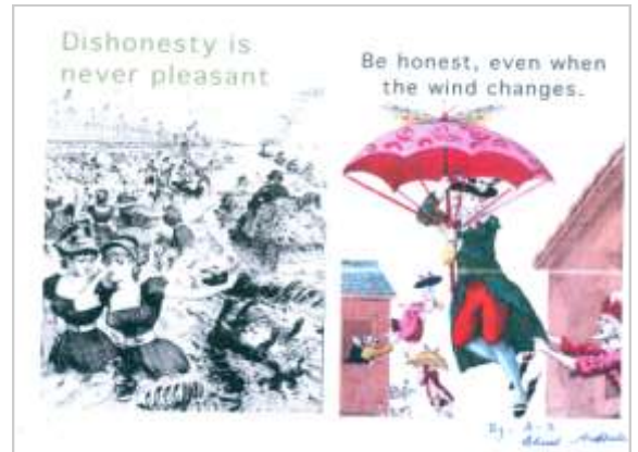
Posters made by Officer Trainees of 85th FC