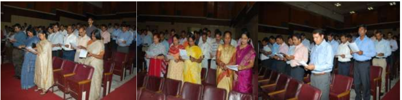
NADT Faculty members, Staff and Officer trainees of 85th FC taking the Pledge

address, the Director General emphasized upon the need for observing and maintaining self-intrinsic values. He also stated that every one should be one's own Vigilance